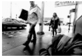
page 20 Felix nodding by the A&C corner store