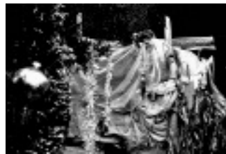
page 168 Christmas at Hank and Petey's camp