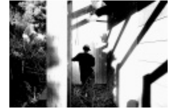
page 220 Hank, Felix, and Carter cutting the remaining pockets of overgrown brush on the highway embankment