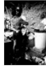
page 62 Cooking dinner