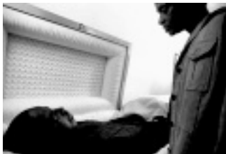
page 291 Carter's viewing in the funeral home