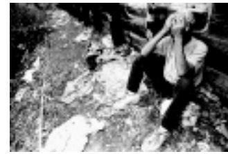
page 78 Hank, dopesick, by the freeway retaining wall