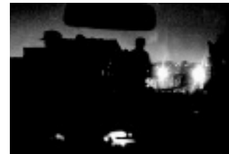
page 250 Carter and Tina hitting a lick at a construction site