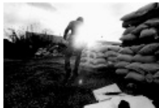
page 146 Max piling sandbags at Macon's construction supply depot