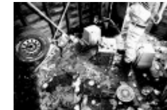
page x Felix muscling in the abandoned shack in the alley behind the corner store