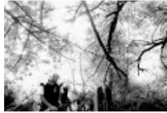
page xxii Hank muscling in his camp following his early release from the hospital