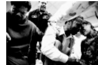
page 258 Carter and Tina receiving the Holy Ghost at Crystal's evangelical church