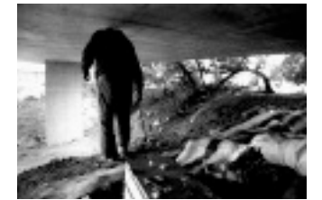
page 86 Hogan leaving camp