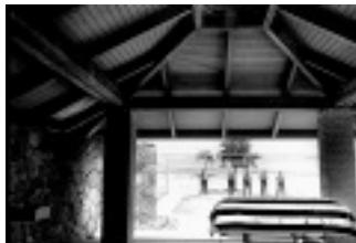
page 293 Carter's military burial