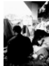
page 61 Early morning at the I-beam camp