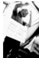
page 169 Hank preparing for a day of panhandling