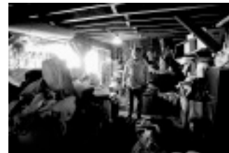
page 298 Hogan in Paul's garage