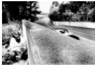
page 2 Frank injecting in the hole