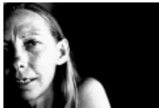
page 10 Nickie: "If you can't see the face, you can't see the misery."