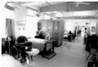
page 312 Max in the city's long-term hospice for the chronically ill and indigent