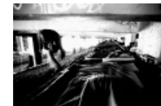
page xvi Frank in a temporary camp under the freeway overpass