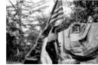
page 216 Hank positioning the flag next to Jeff's Thanksgiving barbecue group portrait