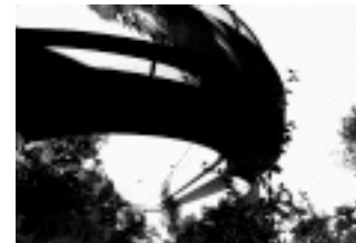
page viii Under the pedestrian ramp crossing the two freeways