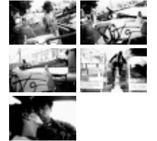
pages 74-75 The road crew lick